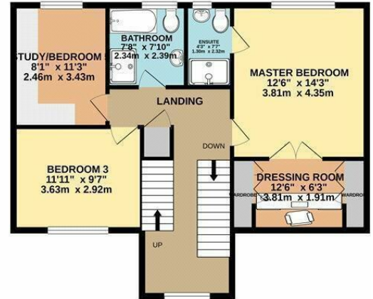
2ND FLOOR 371 sq.ft. (34.4 sq.m.) approx.